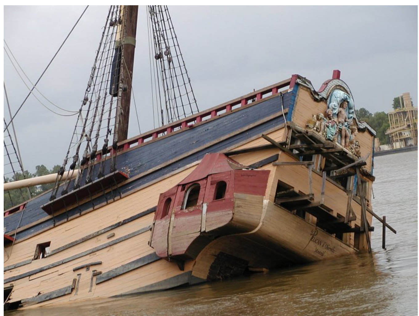
The replica Pelican sinks in the Mississippi